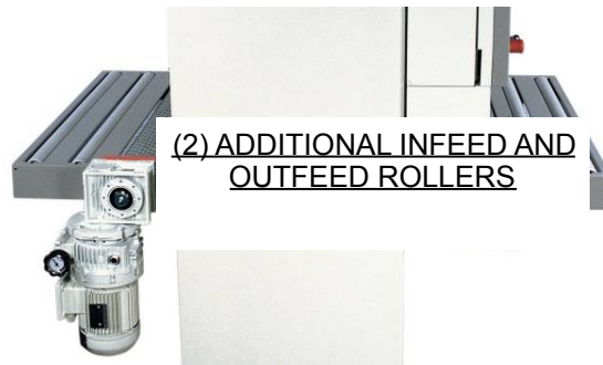
(2) ADDITIONAL INFEED AND OUTFEED ROLLERS