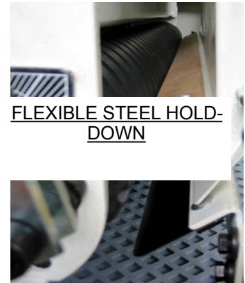
FLEXIBLE STEEL HOLD-DOWN