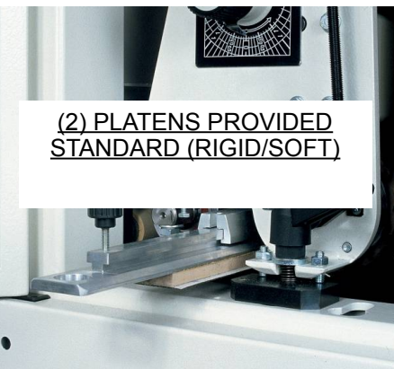
(2) PLATENS PROVIDED STANDARD (RIGID/SOFT)