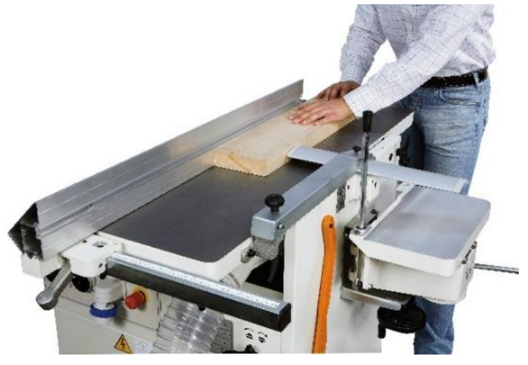
*Euroguard not included, American guard standard for US