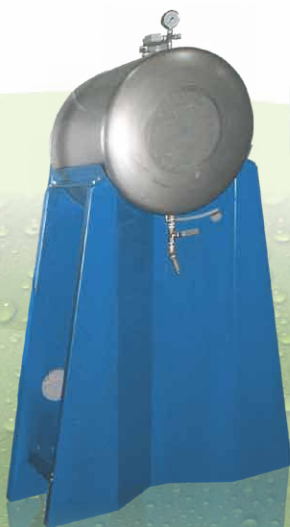
* Optional vacuum for SR60