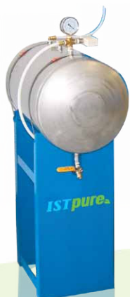
* Optional vacuum for SR30