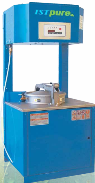
SR30 or 60 recycler