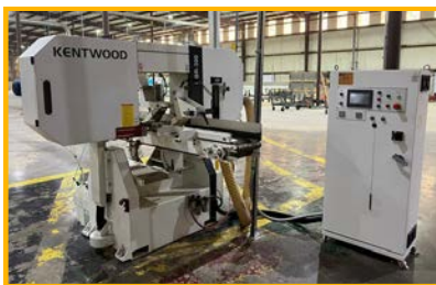
Kentwood "HBR-300" Horizontal Band Re-Saw (2021)