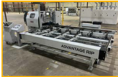
C.M.L./Stiles "E 350 2R Advantage Rip" Gang Rip Saw – (2) Moving Blades