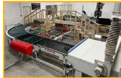
Maincer Powered Conveyor Line - Cross Transfer