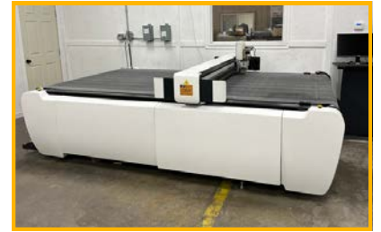
Lecho "BK4" CNC Cutter (2022)