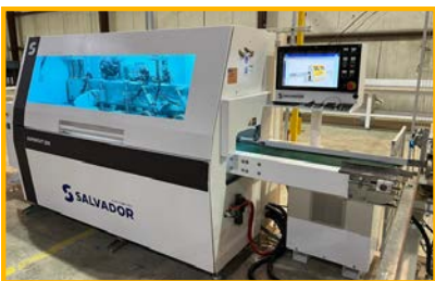
Salvador/Stiles "Supercut 500" Optimizer