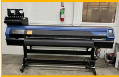
Mimaki "TS100-1600" Printer (2022)