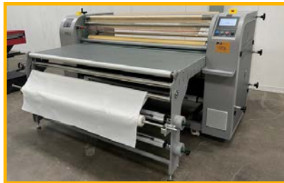
Xpro "DS170" Heat Press (2022)