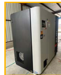
Elgi "EG 75 V-125" Rotary Screw Air Compressor – 100HP (2021) Qty (2)

RSVP for open-house by contacting Eric Beach at 704-608-9830 or eric@machinerymax.com .