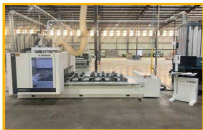
Homag "Centateq P-110" CNC Machining Center - Boring & Grooving (2021)