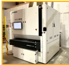
Homag "Sandteq W-300" Widebelt Sander