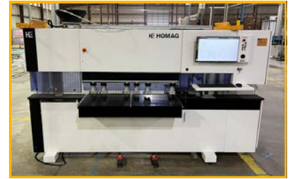
Homag "Drillteq D-510" Horizontal & Vertical Boring/Routing & Dowel Insertion (2021)