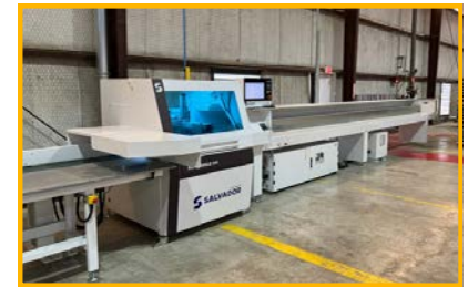
Salvador/Stiles "Superangle 600" Tilting Table Optimizer