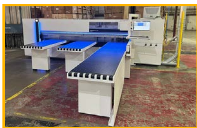
Homag "Sawteq B-400" Profiline Beam Saw