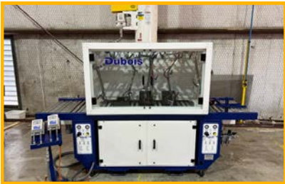
Dubois "SR-12" Linear Feed-Thru Sprayer – 6-Station (2022) "Never used"