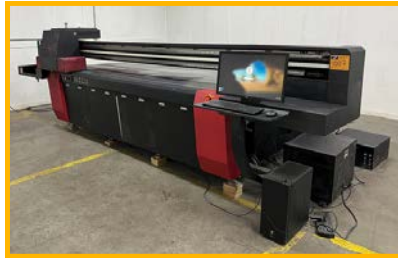
Besjet "M3220GX-150A" Printer (2021)