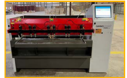
Gannomat "Index Logic" Bore & Dowel Inserter (2020)