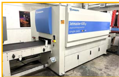
Jetmaster 630 Digital Printer