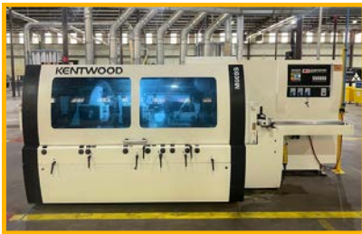
Kentwood/Stiles "M609S" Moulder – 6-Head (2021)