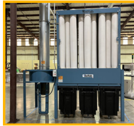
Bel-Fab "BEL 150" Modular Dust Collector & Bins (2021) - Qty (6)