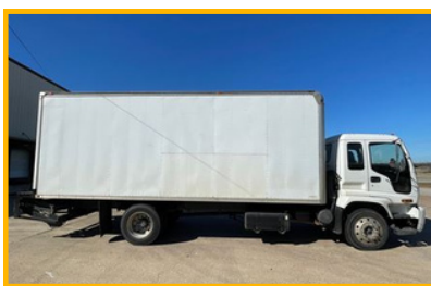
Chevy Box Truck - Turbo Diesel