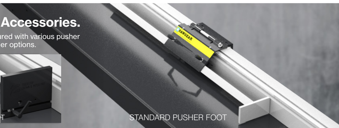
STANDARD PUSHER FOOT